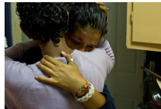
Above Still image from our video "The Call".

#ImHere featured online resources presenting the landscape of immigrant women's issues. These included: a fact sheet about human rights violations faced by immigrant women; real stories of immigrant women around the country affected by harsh laws;