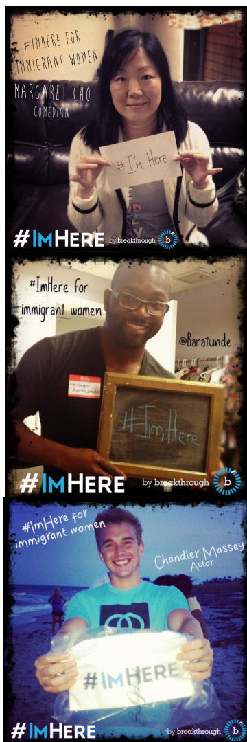
Margaret Cho, Baratunde Thurston, Chandler Massey